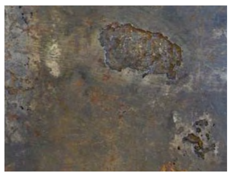
...advanced bio corrosion induced by microbial metabolic products.

Only in Germany, MIC leads to losses in the amount of double-digit billions and to environmental damages of inestimable dimensions; 20% of all costs caused by corrosion are based on microbial destruction of the material.