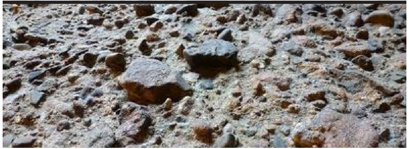
Extreme concrete erosions..

Anaerobic biocorrosion (MIC) causes much trouble in different sectors of industry. The anaerobic microorganisms provoke a 10-times higher corrosion rate by the release of specific enzymes (mainly