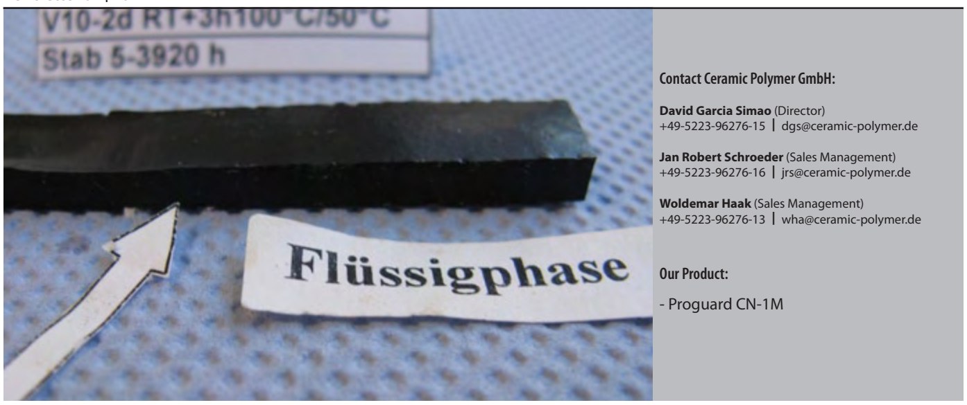
Proguard CN-1M test rod after 3.920 hours of storage in the highly aggressive test-liquid