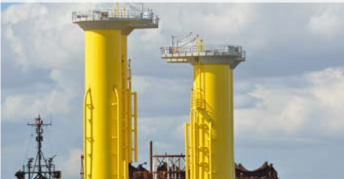
► Our offshore coatings ensure the functionality of energy plants