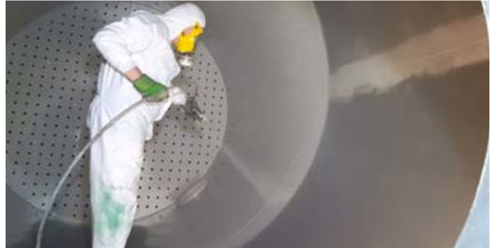
► Internal coating of gravel filters and activated carbon filter tanks