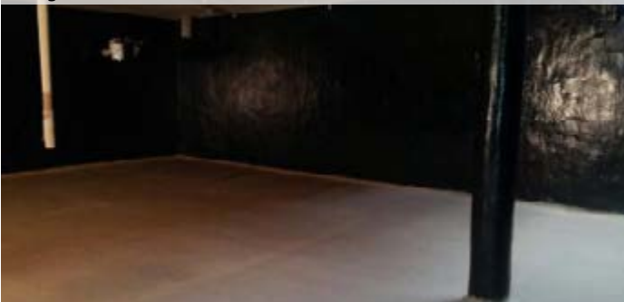
► Coating of storage room for aggressive bio-waste with Proguard CN-1M!