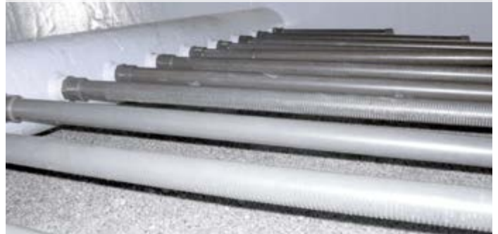
► Refurbishment of swimming pool filter achieves a reduction of fresh water consumption of nearly 50 %