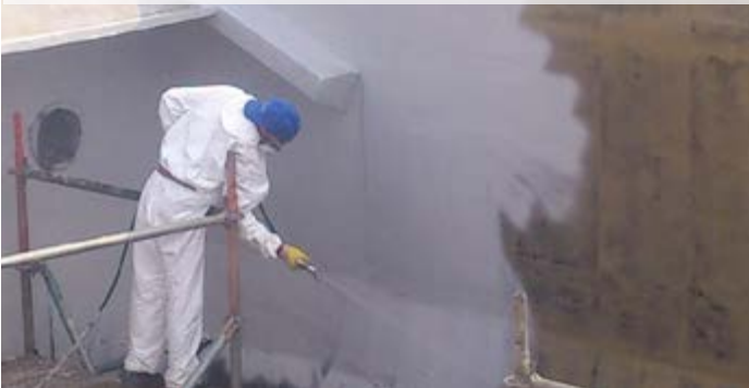
► Refurbishment of a buffer tank in a sewage plant