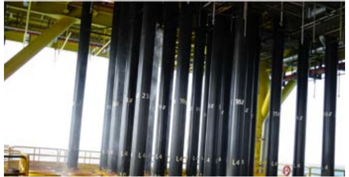
► External coating of risers and injection pipes for oil platforms in China