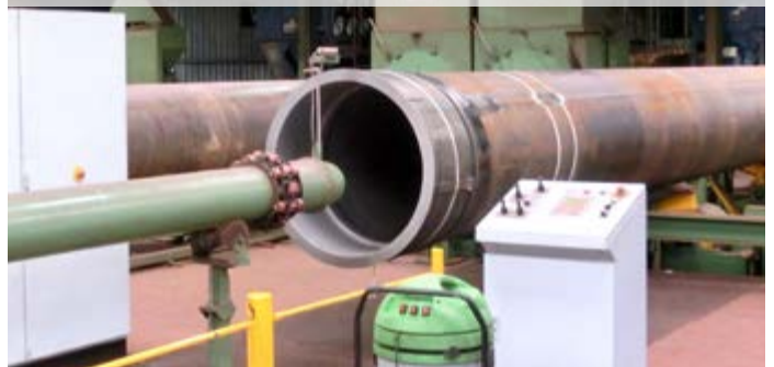
► Internal coating of cooling water intake risers for extensive FLNG-Project in Australia