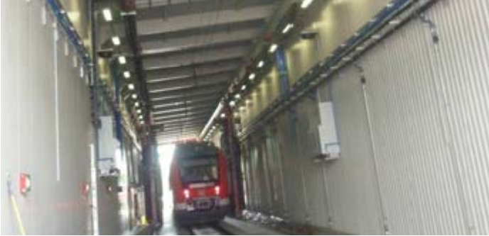
► Coating of a wash tunnel of "German Railways" – resistant against acidic detergent