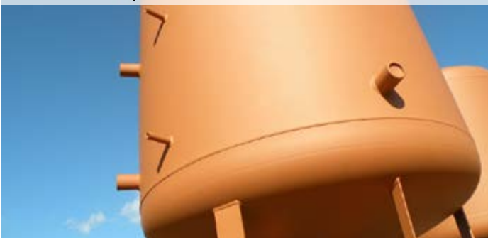
► Ceramic-Polymer KTW-1 passed test series according to DVGW-W270 and warm water up to 60 °C