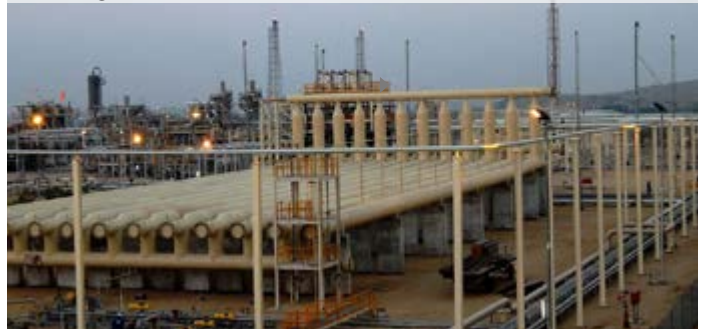
► Internal coating of slug catcher pipelines for the extraction of natural gas