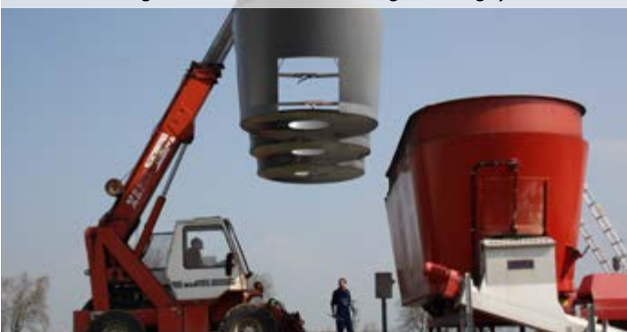
► Internal coating of substitution tanks for biogas feeding systems