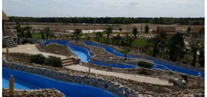
► UV-resistant coating for Germany's longest whitewater course at the "Tropical Islands"