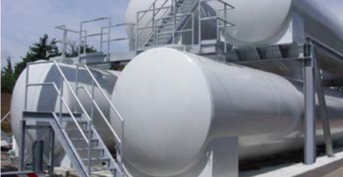
► Internal coating of storage tanks for methanol