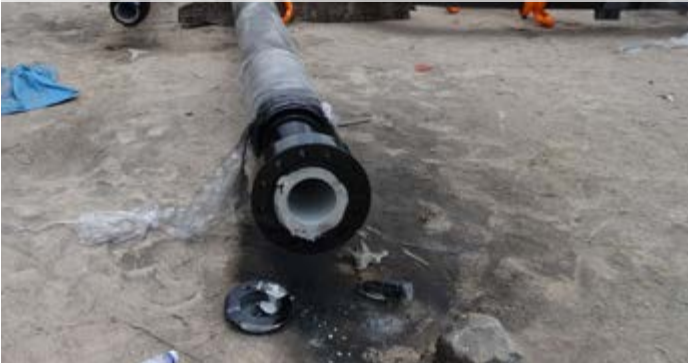
► Internal coating of pipelines for high-temperature crude oil (80 °C)