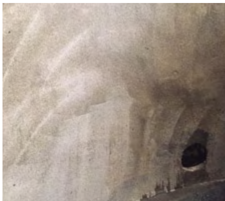
Primed wall area, sprinkled with quartz sand