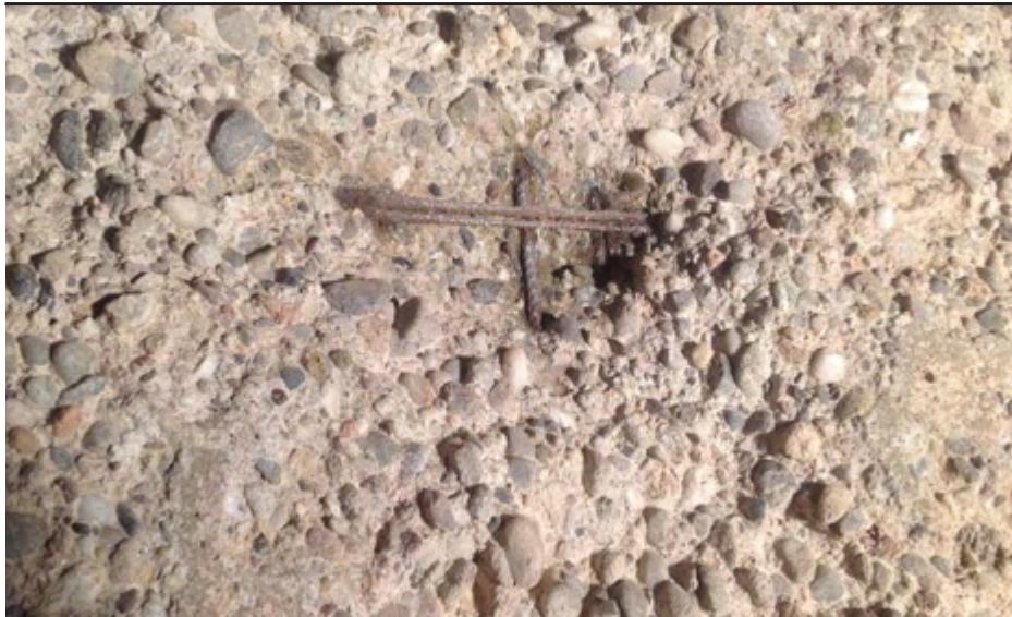
"Washed-out-concrete-effect" - caused by aggressive acids in the ensilage