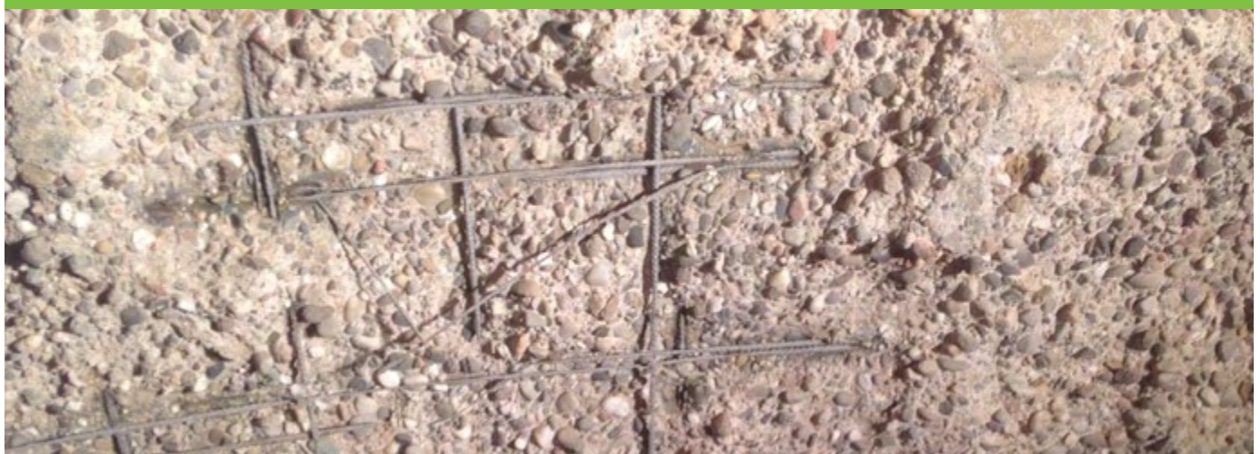
Extreme concrete erosions, induced by biogenic sulfuric acid attack (BSA)

Heidelberg/Germany: The ensilage tank of a huge biogas plant showed extremely heavy concrete erosions due to high chemical attack from the fermentation material. The concrete substrate had to be refurbished urgently to ensure the functionality of the tank and prevent disastrous leakages. Henceforth, our product PROGUARD CN-1M protects the concrete reliably against chemical attack.