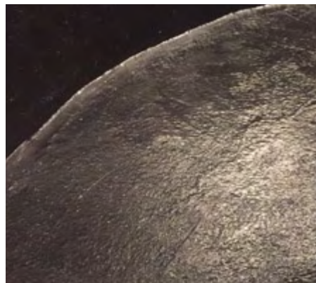
Coated wall and floor