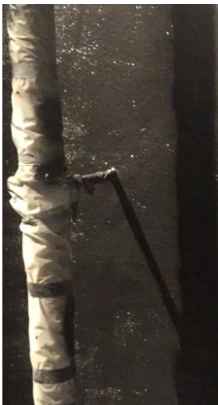
Coated wall area

Firstly, the surface was grit blasted to remove loose concrete. Then the tank could be restored with conventional concrete grout.