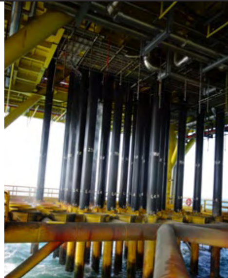
Riser pipes (black) after 10 months of operation