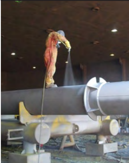
Application of the first layer - in grey color

Ceramic-Polymer SF/LF-SRB in grey (RAL 7035) and black (RAL 9005) color