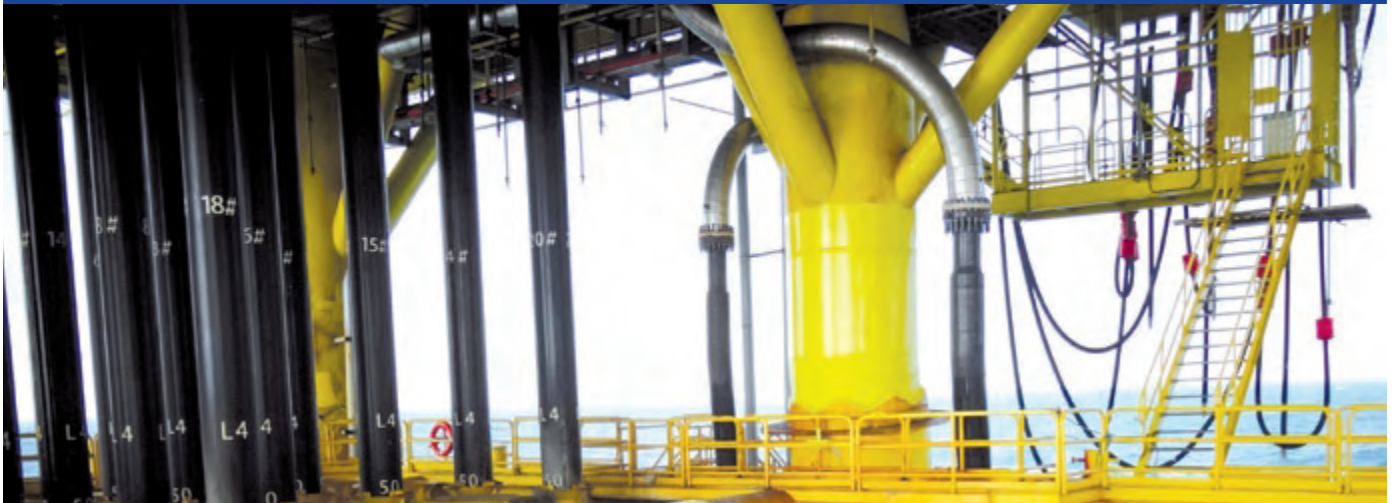
Riser pipes (black) after 10 months of operation