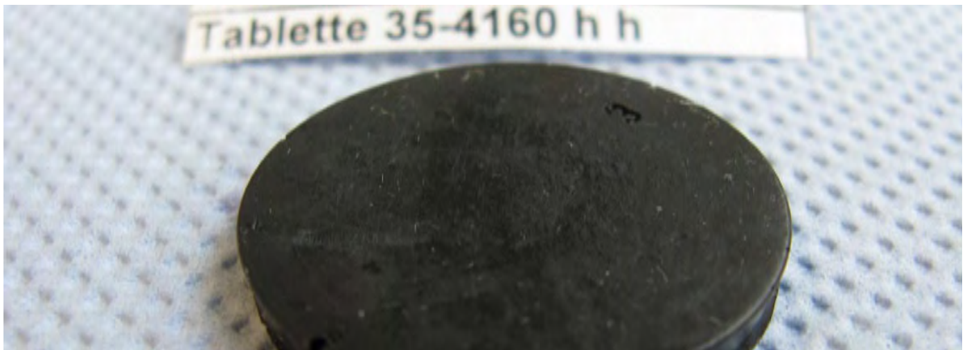
Proguard CN-1M test tablet after 4.160 hours of storage in the highly aggressive test-liquid