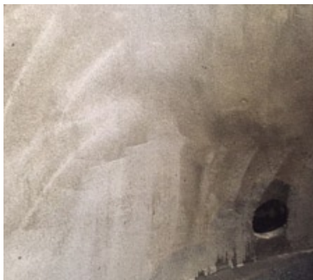
Primed wall area, sprinkled with quartz sand