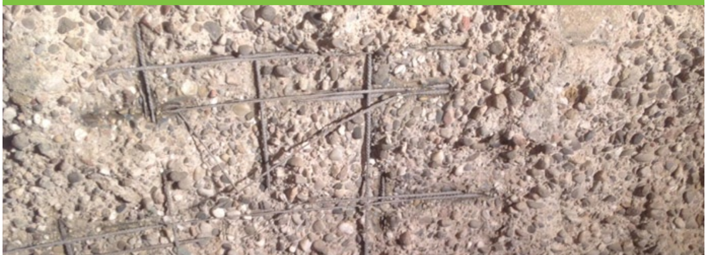
Extreme concrete erosions, induced by biogenic sulfuric acid attack (BSA)

Heidelberg/Germany: The ensilage tank of a huge biogas plant showed extremely heavy concrete erosions due to high chemical attack from the fermentation material. The concrete substrate had to be refurbished urgently to ensure the functionality of the tank and prevent disastrous leakages. Henceforth, our product PROGUARD CN-1M protects the concrete reliably against chemical attack.