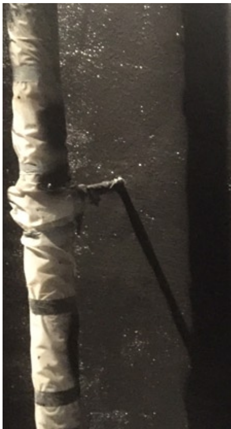
Coated wall area

Firstly, the surface was grit blasted to remove loose concrete. Then the tank could be restored with conventional concrete grout.