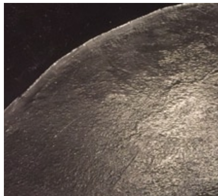
Coated wall and floor