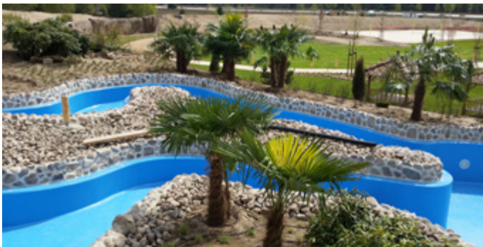
Finished project with our effective 3-layer-concept

„Tropical Islands“ is the biggest tropical swimming resort in Europe with exceptional waterparks, attractions and accommodations. Recently, Germany's longest whitewater course, the „Wild-Water-River“ was opened in their outdoor area AMAZONIA. For the effective protection against UV-radiation, weathering and abrasion our coating systems were applied on the 250 m long concrete channel.