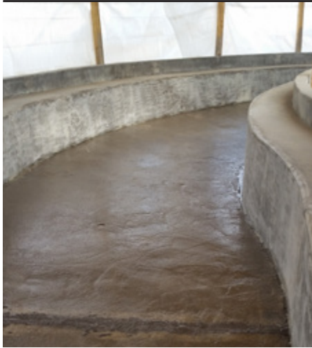
Treatment with primer CP-SYNTOFLOOR 8010