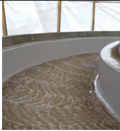
After curing of the prime coat the surface was grinded and the coating product PROGUARD CN 200 was applied