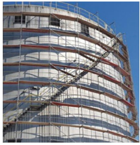
A thin layer of both coating and top coat was simply applied by airless spraying.