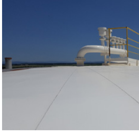
The roof area was prepared by sandblasting pursuant to