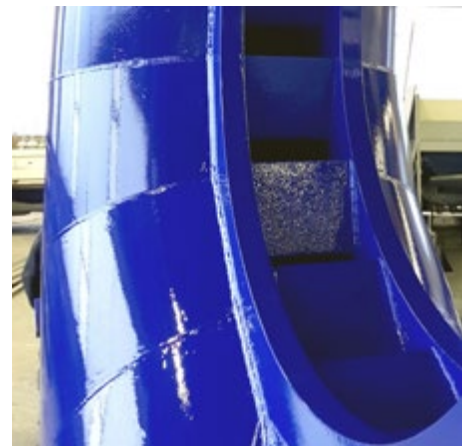
PROGUARD CN 200 provides perfect coating results and short curing times.

Are you searching for specific coatings for protection against corrosion and abrasion?