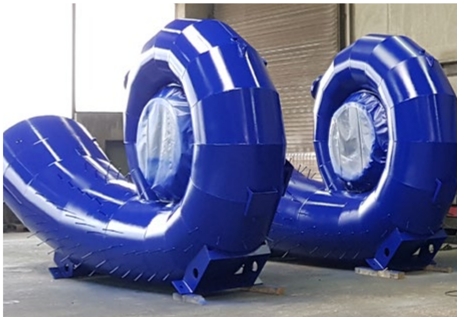
The spiral pipes have a total diameter of 3.60 meters.