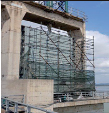
Coated lock gate, upstream side