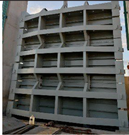
Coated lock gate, downstream side