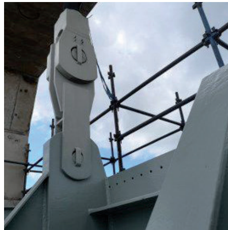
Coated suspension system link