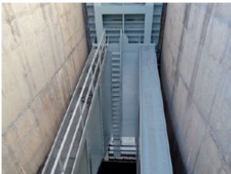
Coated radial gate