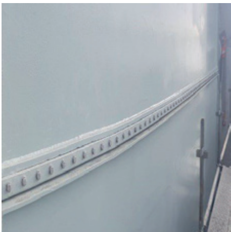
Coated gate with refurbished lashing strip

All metal components were equipped with PROGUARD CN 200, our premium epoxy coating for reliable and durable protection against corrosion in aggressive marine and industrial environments. The parts, which are exposed to air and sunlight where additionally coated with PROGUARD 169 (37). Our topcoat features high protective properties in accordance with ISO 12944-2, corrosivity class C5.