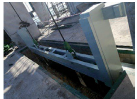
Refurbished grapple of trash rack

We support you with reliable coatings for highest maritime requirements – please contact our expert team for all questions regarding corrosion protection!